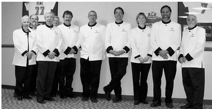
Some of last year's volunteers