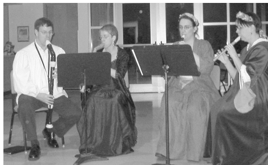
MVUUF Recorder Consort performs at the Renaissance Revel