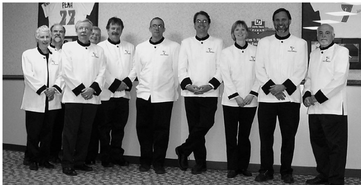
Some of last year's volunteers

We are going to limit the number of games we work based on the total number of volunteers we have. We are asking that you work a maximum of five games (one a month) and a minimum of three. The season runs from April through August, with playoffs in September. We cannot schedule any dates in September until the third week of August (or when the Dragons qualify for the playoffs).